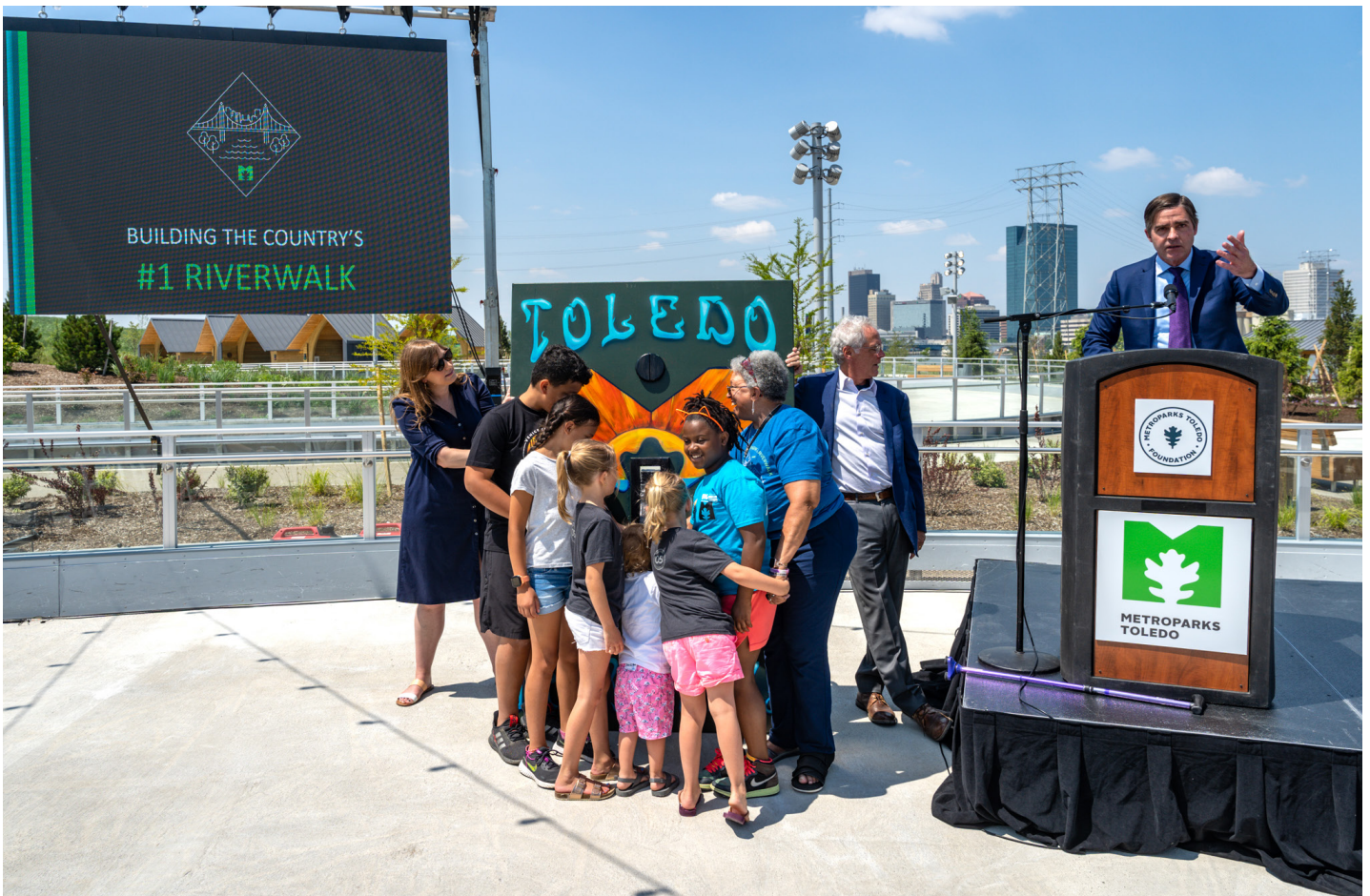
Glass City Metropark Phase 2 Grand Opening

The SJS Mission is to empower you to build a better life. That extends to our teammates, clients, and community members. I have deep gratitude for my teammates at SJS who created the supportive culture that allows me and my fellow colleagues the opportunity to be part of improving our respective communities.